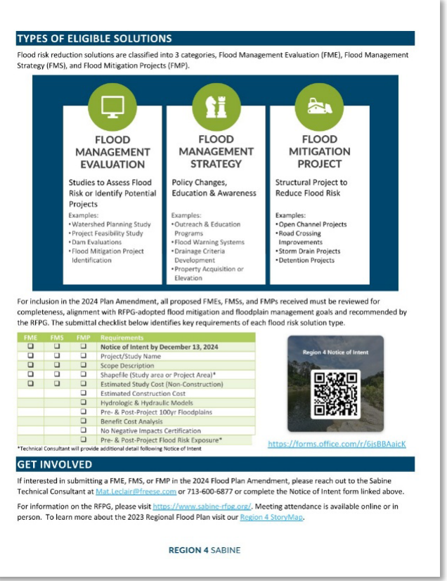
FIGURE 1: AMENDMENT #2 OUTREACH FLYER